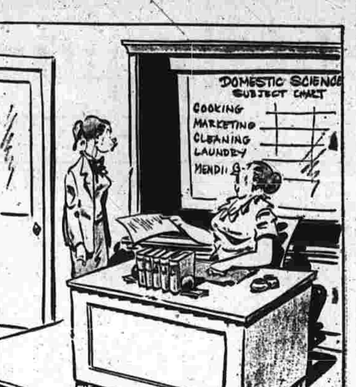
Time to Eat