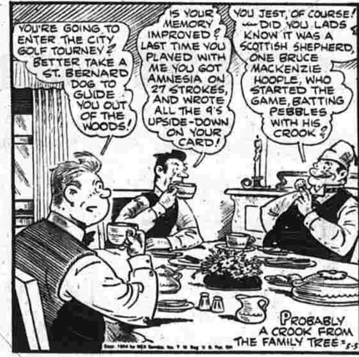
High And Dry BY V. T. HAMLIN