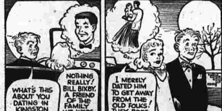
FRECKLES AND HIS FRIENDS